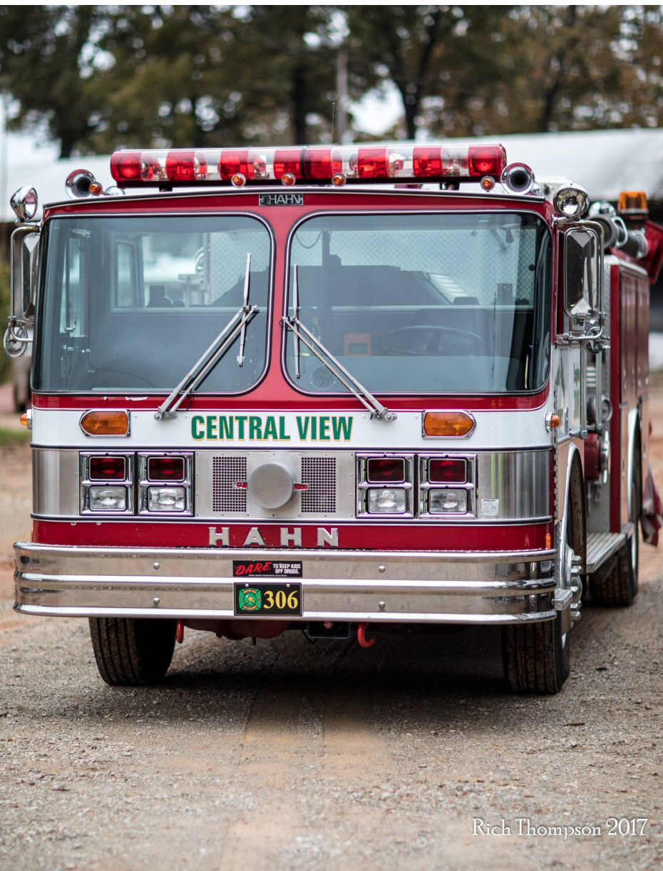
Rich Thompson 2017